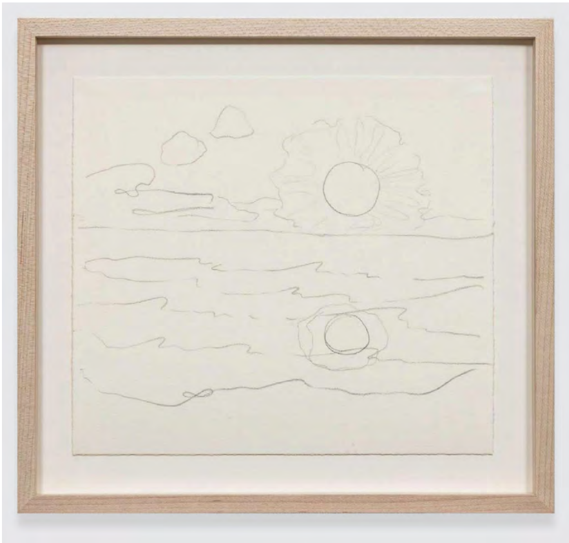
"Sunset Sound" (2024).